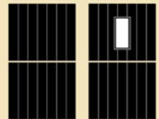
MORGAN SOLID AUSTIN 1