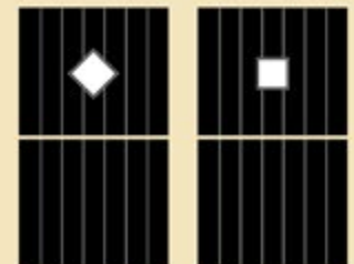
CATERHAM 1 RILEY 1

Due to printing limitations the colours shown may not be an exact match to the actual door, samples of colour can be provided on request. Hallmark Panels Limited reserve the right to withdraw or replace any of the products shown without prior notice.